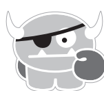
TARTAR THE TERRIBLE